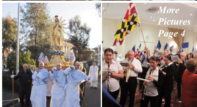
More Pictures Page 4