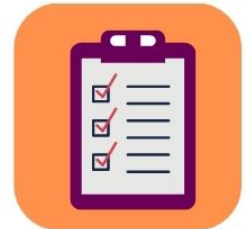
CENTRELINK - VARIOUS FORMS